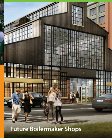
Future Boilermaker Shops