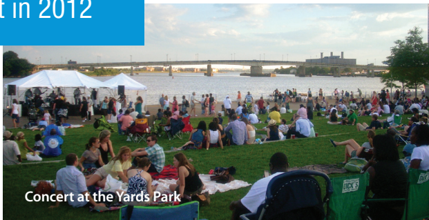
Concert at the Yards Park

events occurred in the first year of the Yards Park.