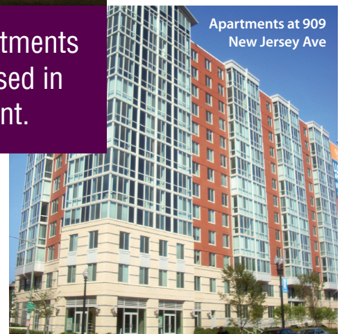
Apartments at 909 New Jersey Ave