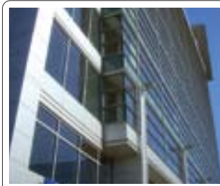
6. 20 M STREET Office: 180,633 SF Retail: 10,000 SF