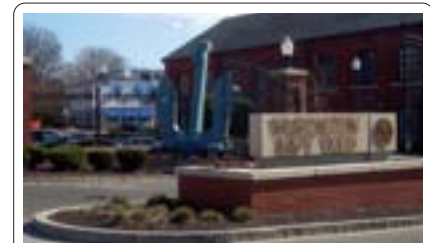
26. NAVY YARD Office: 2.2 million SF