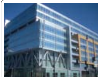
15. 55 M STREET Office: 275,000 SF Retail: 15,000 SF