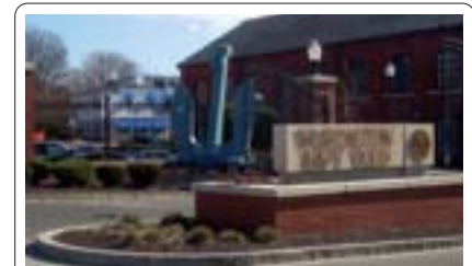
26. NAVY YARD Office: 2.2 million SF