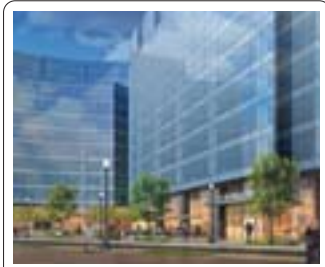
2. PLAZA ON K Office: 795,000 SF Retail: 30,000 SF