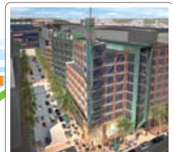
14. 25 M ST / 1201 HALF ST Office: 370,000 SF Retail: 75,000 SF