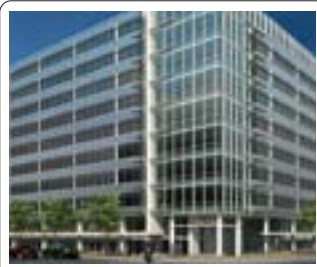
4. 1015 HALF STREET Office: 379,000 SF Retail: 21,000 SF