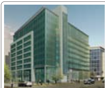
11. FEDERAL GATEWAY II Office: 213,000 SF Retail: 12,000 SF