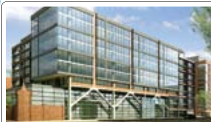
19. 401 M STREET Office: 376,000 SF Retail: 56,000 SF