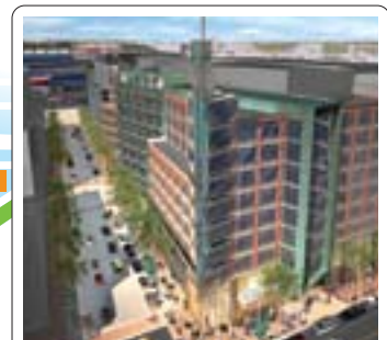
14. 25 M ST / 1201 HALF ST Office: 370,000 SF Retail: 75,000 SF