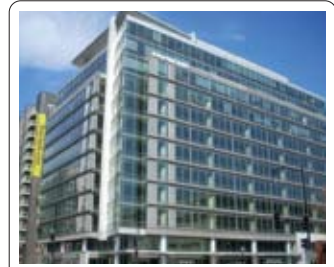
9. 100 M STREET Office: 225,000 SF Retail: 15,000 SF