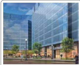
2. PLAZA ON K Office: 795,000 SF Retail: 30,000 SF