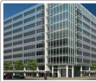
4. 1015 HALF STREET Office: 379,000 SF Retail: 21,000 SF