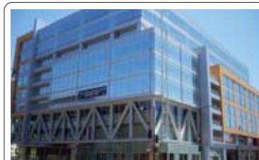
17. 55 M STREET Office: 275,000 SF Retail: 15,000 SF