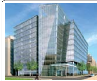
5. 1100 S. CAPITOL Office: 350,000 SF Retail: TBD