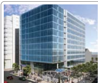
10. 1111 NEW JERSEY AVENUE Office: 203,000 SF Retail: 8,000 SF