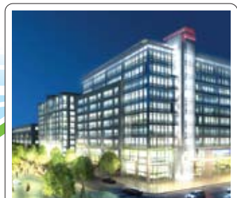
12. 250 M AT CANAL PARK Office: 213,000 SF Retail: 12,000 SF