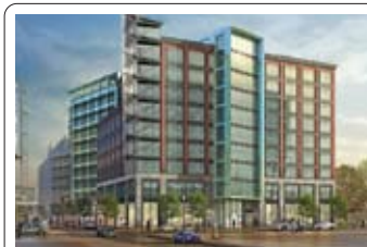
16. 25 M ST / 1201 HALF ST Office: 370,000 SF Retail: 75,000 SF