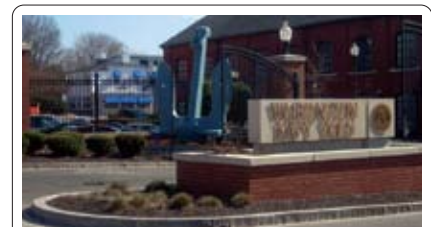
29. NAVY YARD Office: 2.2 million SF