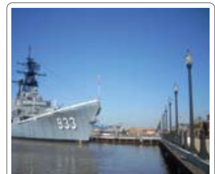
9. ANACOSTIA RIVERWALK TRAIL