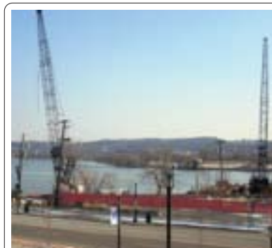
8. DIAMOND TEAGUE PARK (2009)