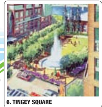
6. TINGEY SQUARE