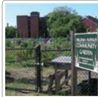
3. VIRGINIA AVE COMMUNITY GARDEN