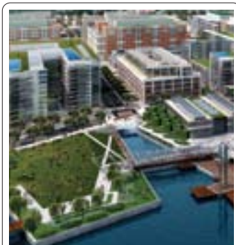
7. THE YARDS RIVERFRONT PARK (2010)