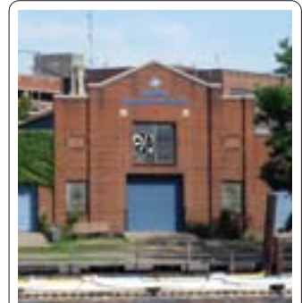
4. BOATHOUSE ROW