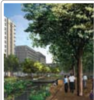
1. CANAL PARK (2011)