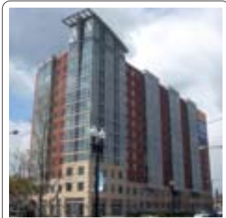
4. 909 AT CAPITOL YARDS JPI, 237 units