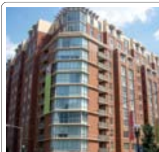
7. CAPITOL HILL TOWER Valhal, 344 units