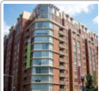
7. CAPITOL HILL TOWER Valhal, 344 units