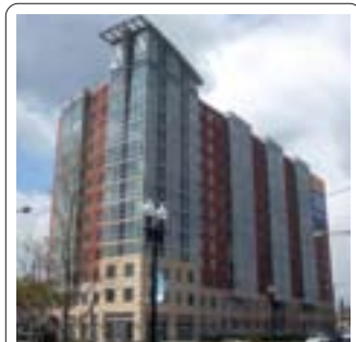
4. 909 AT CAPITOL YARDS JPI, 237 units