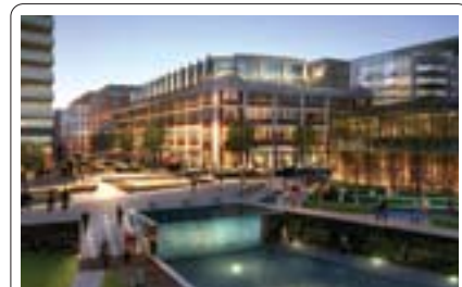
15. FOUNDRY LOFTS Forest City Washington, 170 units