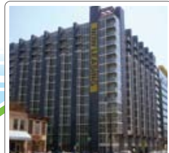
8. ONYX ON FIRST Faison, 266 units