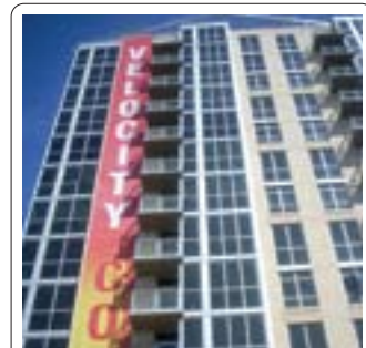
6. VELOCITY CODOMINIUMS Cohen Companies, 200 units