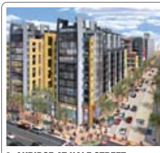
9. AKRIDGE AT HALF STREET Akridge, 280 units