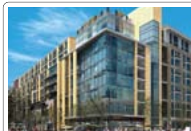
10. HALF STREET RESIDENTIAL Monument Realty, 340 units