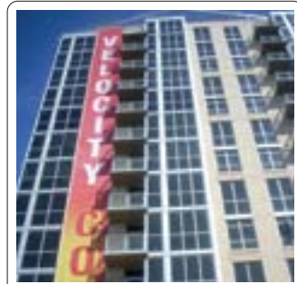
6. VELOCITY CODOMINIUMS Cohen Companies, 200 units