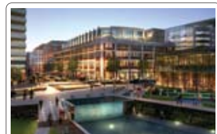
15. FOUNDRY LOFTS Forest City Washington, 170 units