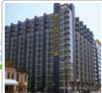
8. ONYX ON FIRST Faison, 266 units