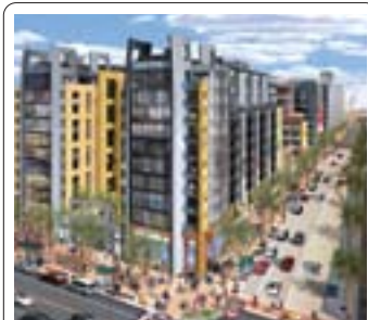
9. AKRIDGE AT HALF STREET Akridge, 280 units