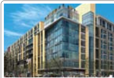
10. HALF STREET RESIDENTIAL Monument Realty, 340 units