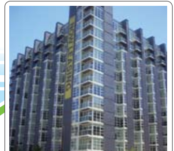
13. ONYX ON FIRST Faison, 266 units