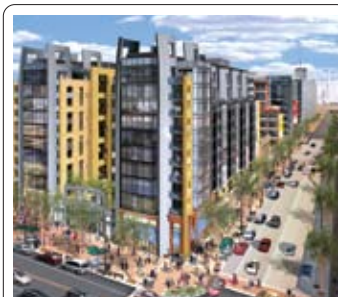
15. AKRIDGE AT HALF STREET Akridge, 280 units