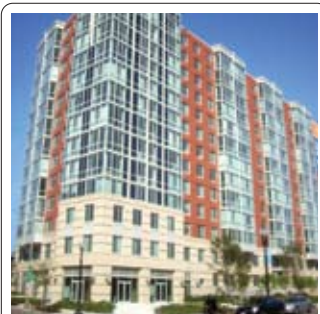
4. 909 AT CAPITOL YARDS JPI, 237 units