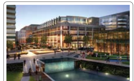
21. FOUNDRY LOFTS Forest City Washington, 170 units