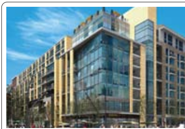
16. HALF STREET RESIDENTIAL Monument Realty, 340 units