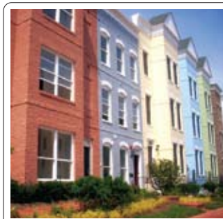
6. CAPITOL QUARTER TOWNHOMES EYA, 323 units