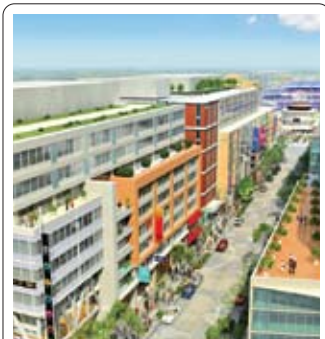
27. HALF STREET 50,000 SF, 196 hotel rooms