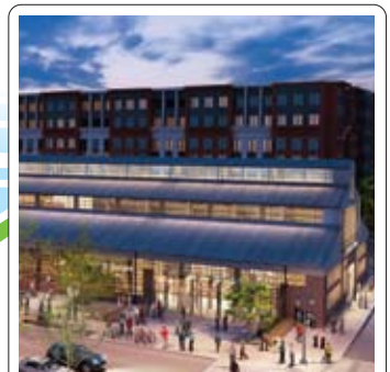
35. BOILERMAKER SHOPS 45,500 SF