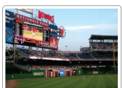
41. NATIONALS PARK 40,000 SF