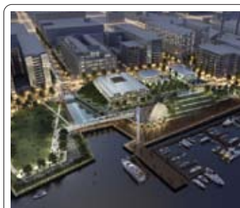
40. PARK PAVILIONS 57,500 SF