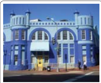
19. CAR BARN 94,400 SF