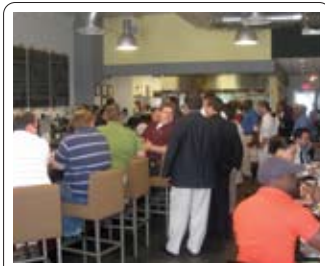
7. JUSTIN'S CAFE 2,000 SF