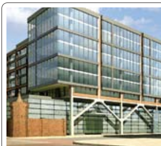
31. 401 M STREET 56,000 SF (Grocery Store site)