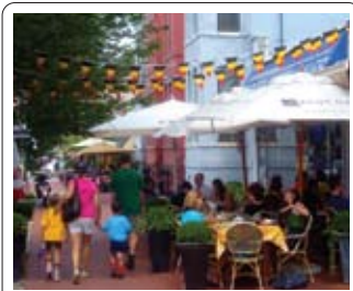
21. BARRACKS ROW 30 Restaurants & Shops