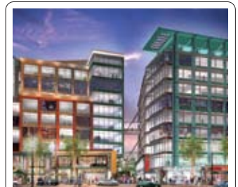
26. AKRIDGE AT HALF STREET 75,000 SF