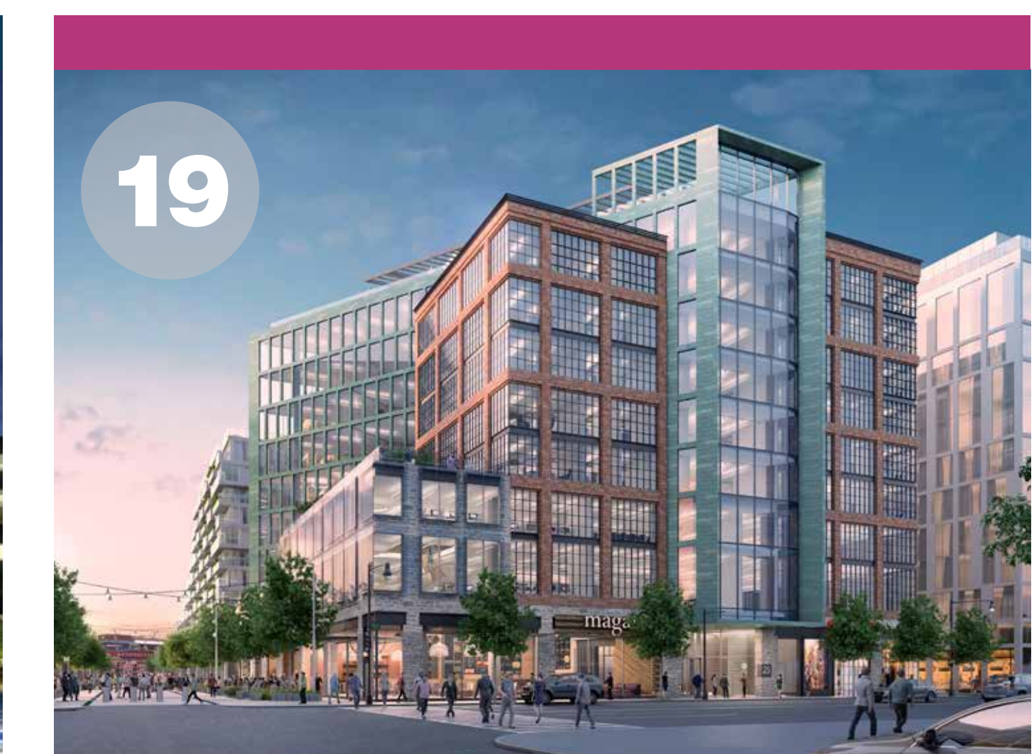
19 25 M AKRIDGE/BRANDYWINE OFFICE: 225,000 SF / RETAIL: 23,000 SF