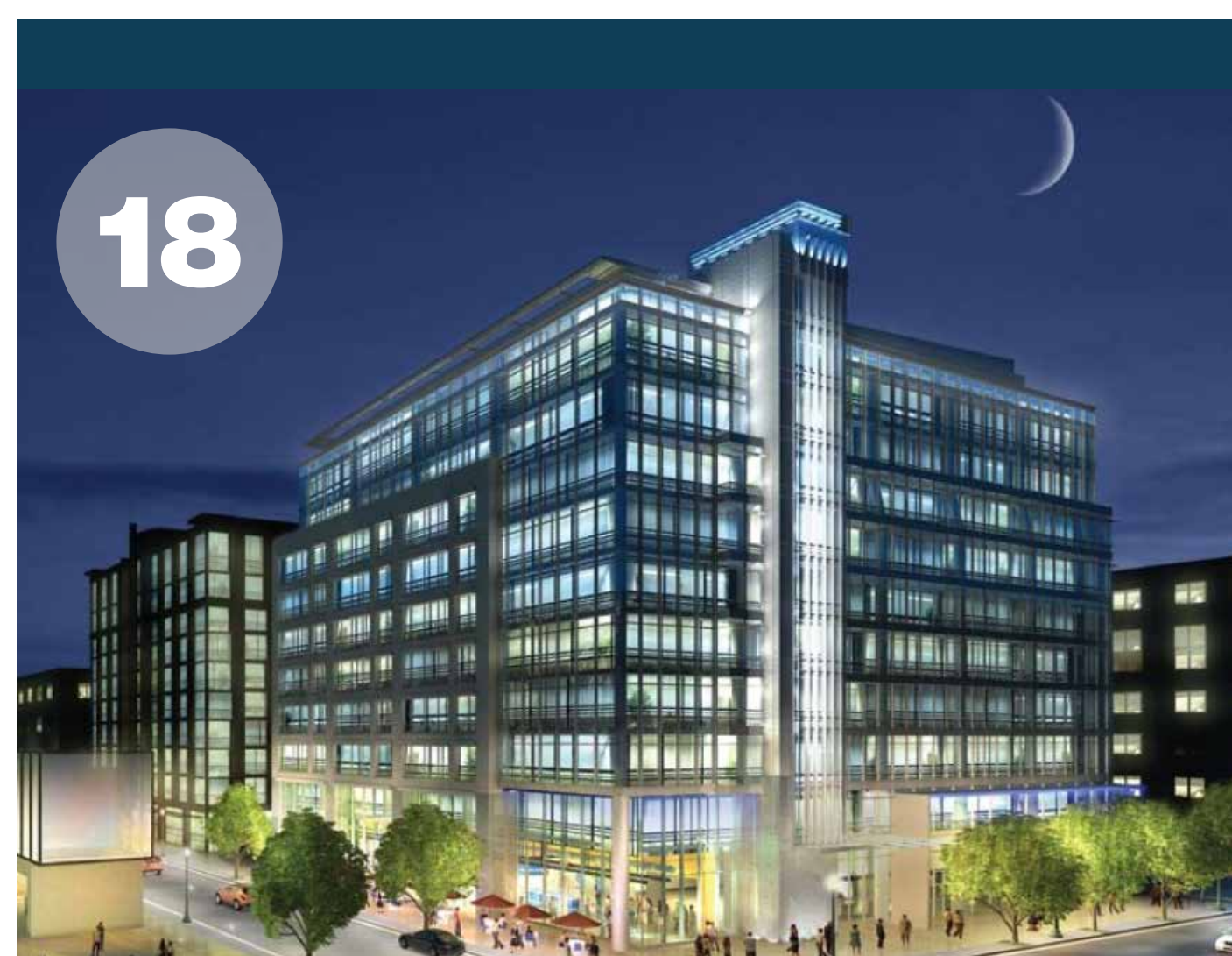
18 250 M AT CANAL WC SMITH OFFICE: 174,500 SF / RETAIL: 7,000 SF