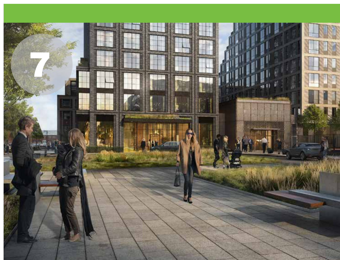
TINGEY PLAZA/TINGEY SQUARE