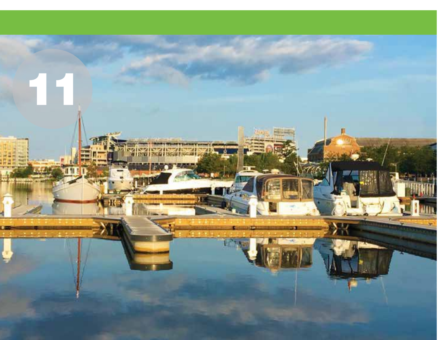
THE YARDS MARINA