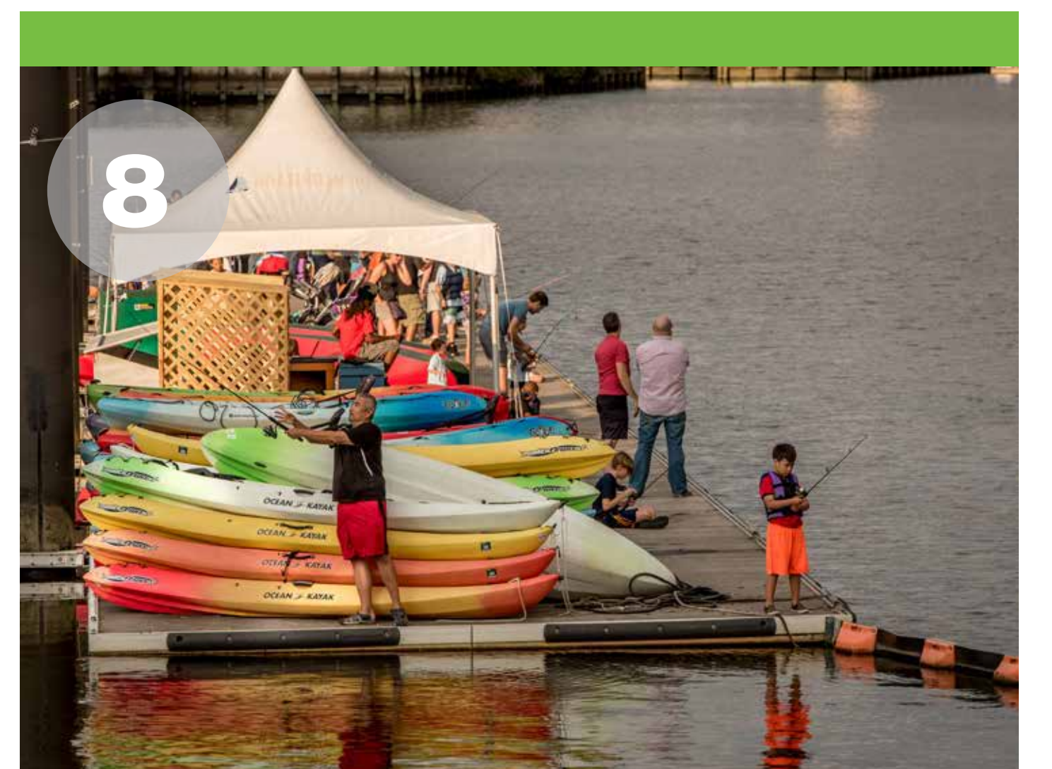
DIAMOND TEAGUE PARK & PIERS