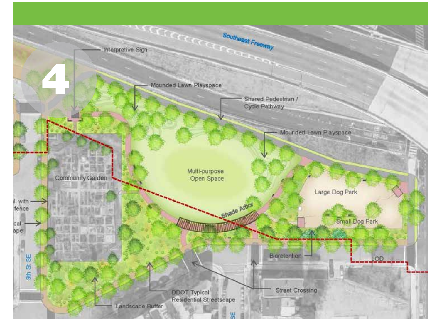
VIRGINIA AVENUE PARK