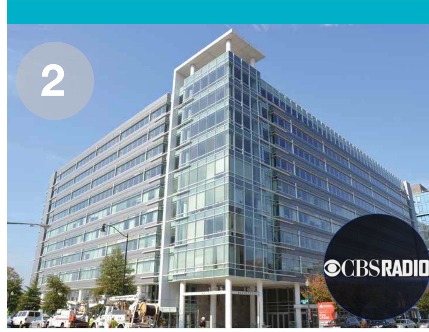
2 1015 HALF OPUS EAST/DOUGLAS WILSON COS. (DWC) OFFICE: 373,700 SF / RETAIL: 17,350 SF