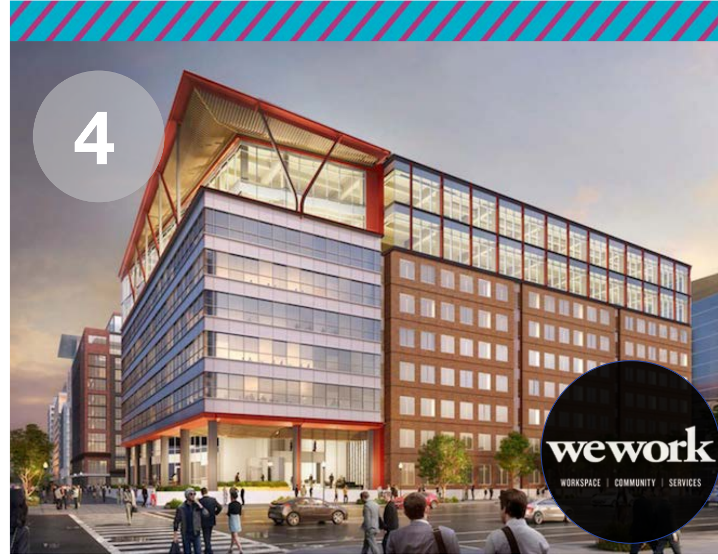
4 80 M COLUMBIA PROPERTY TRUST OFFICE: 286,300 SF PLANNED ADDITIONAL OFFICE: 88,000 SF