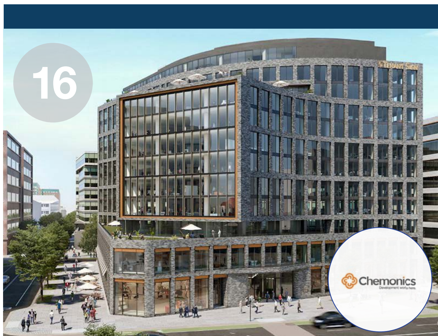
16 CHEMONICS HEADQUARTERS BROOKFIELD PROPERTIES OFFICE: 285,000 SF / RETAIL: 14,100 SF