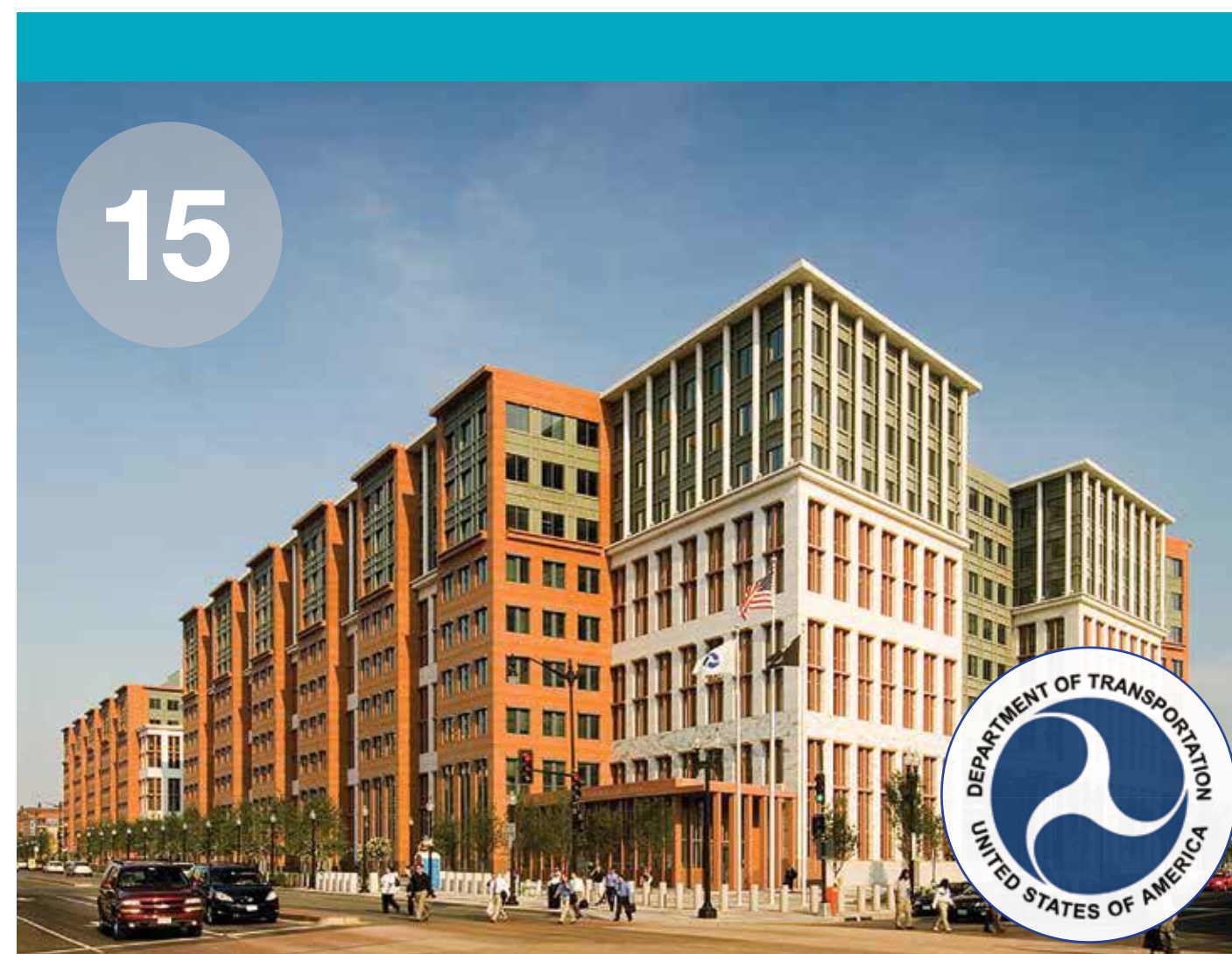
15 U.S. DEPT. OF TRANSPORTATION JBG SEFC OFFICE: 1,350,000 SF / RETAIL: 1,200 SF