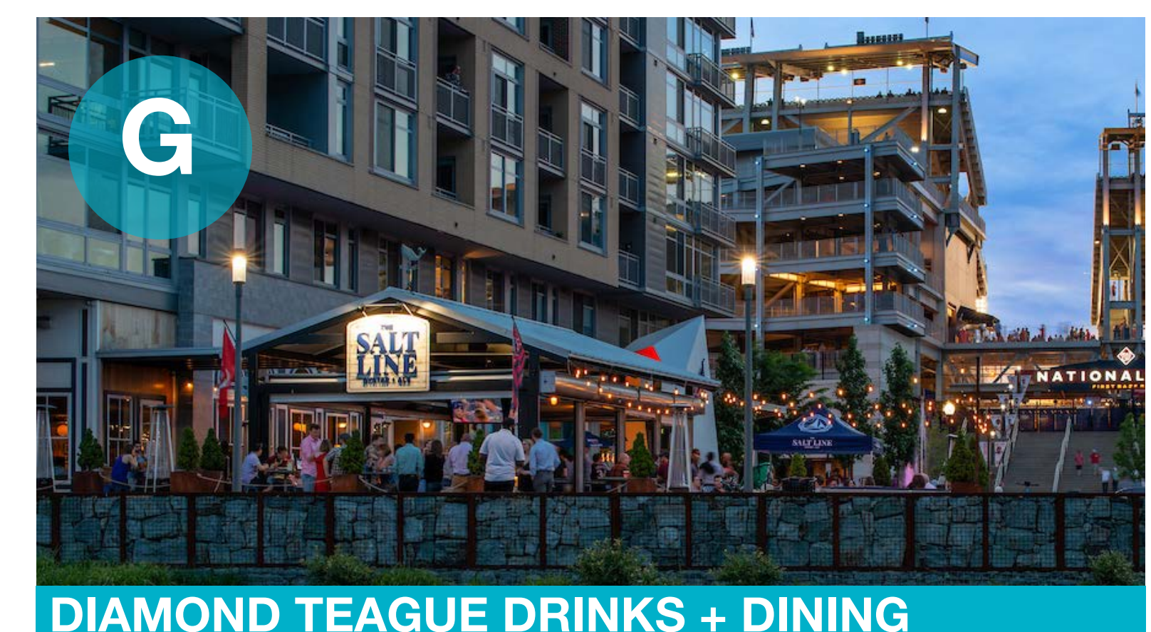
G DIAMOND TEAGUE DRINKS + DINING