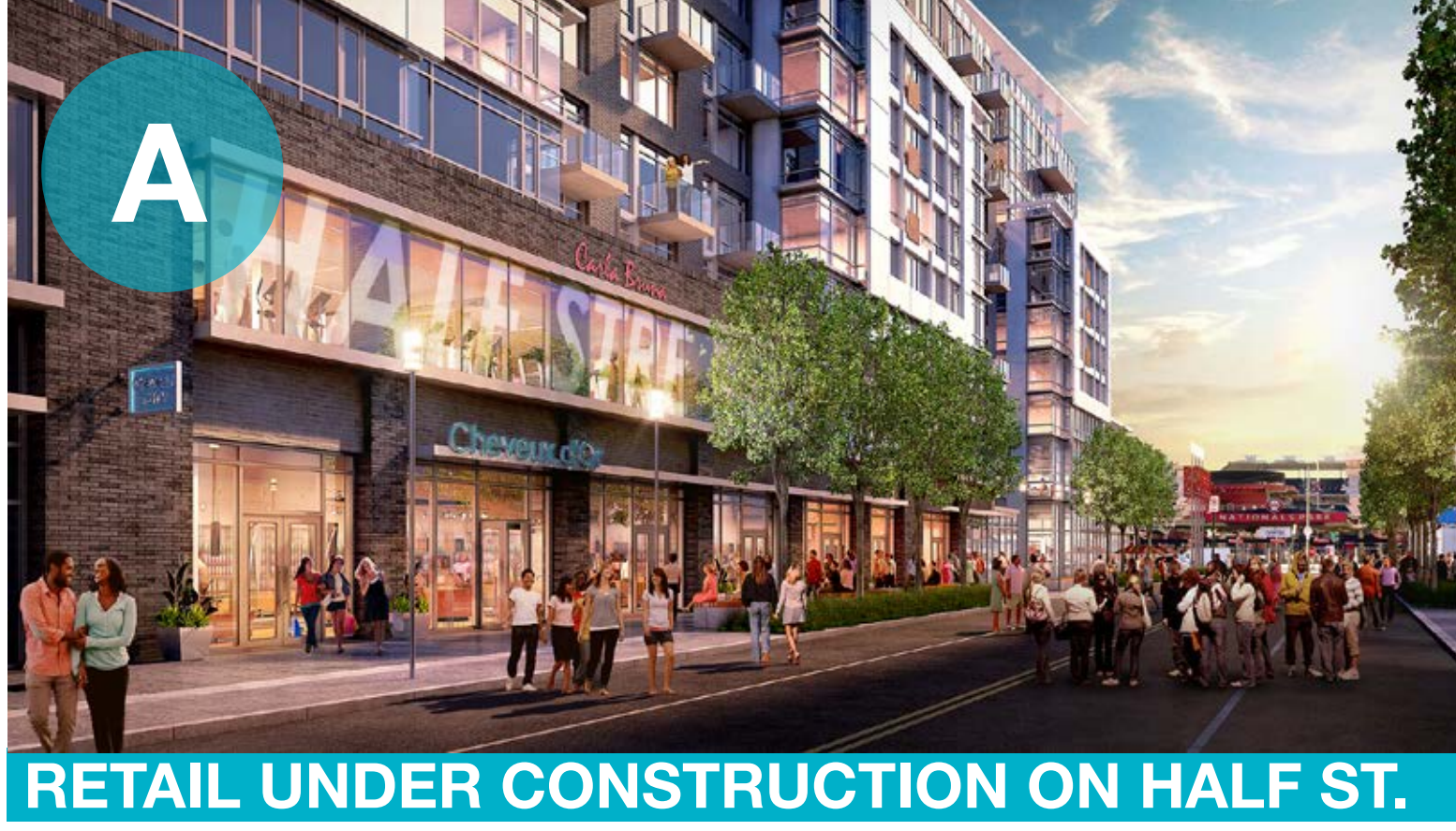
A RETAIL UNDER CONSTRUCTION ON HALF ST.