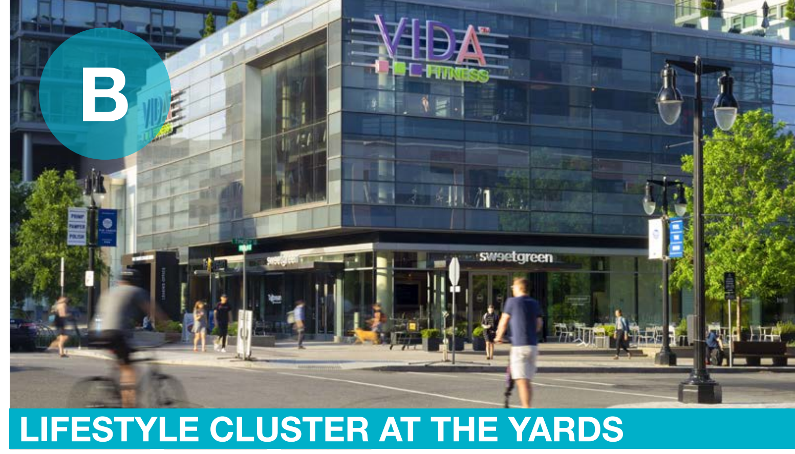
B LIFESTYLE CLUSTER AT THE YARDS