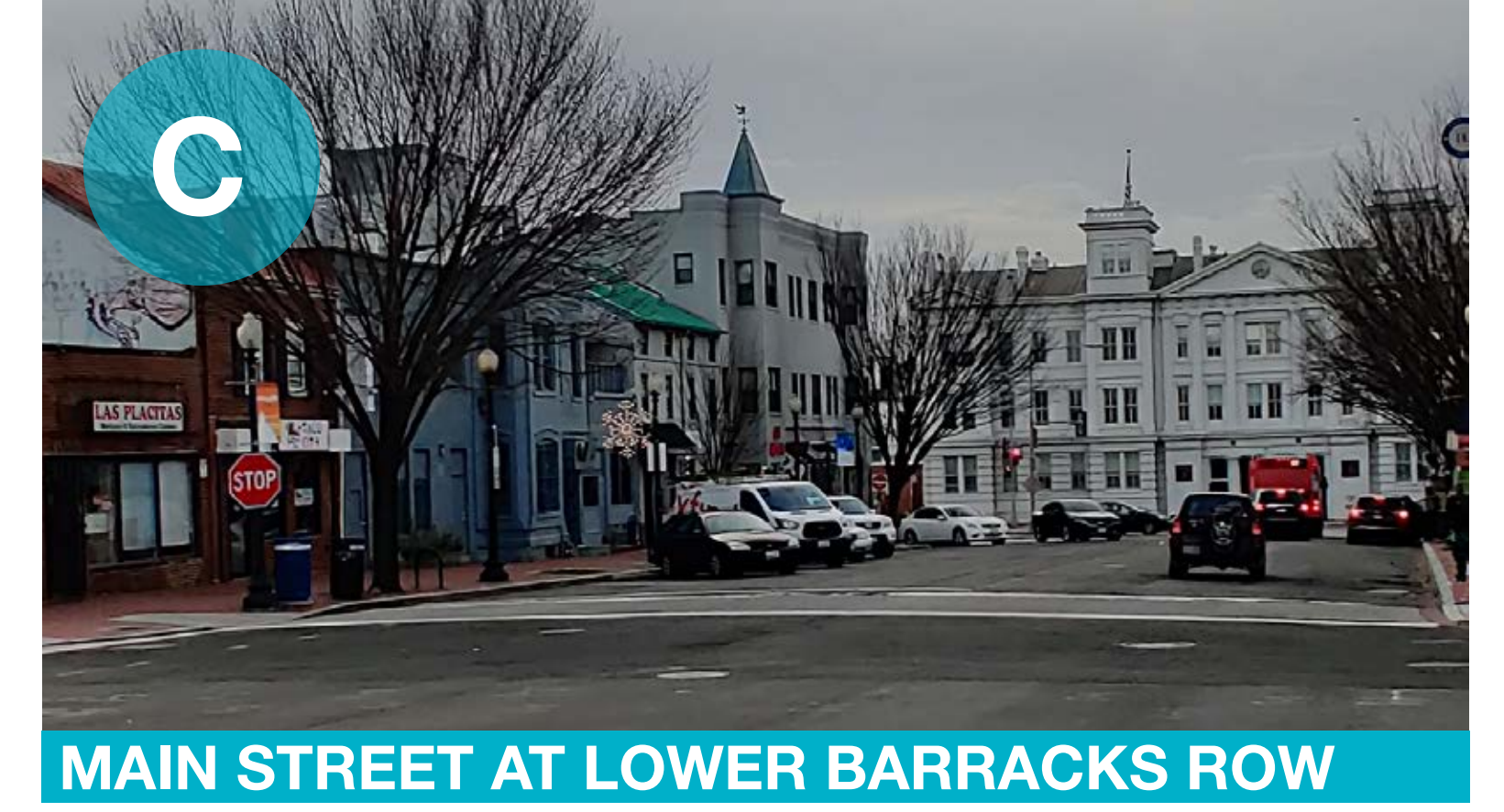
C MAIN STREET AT LOWER BARRACKS ROW