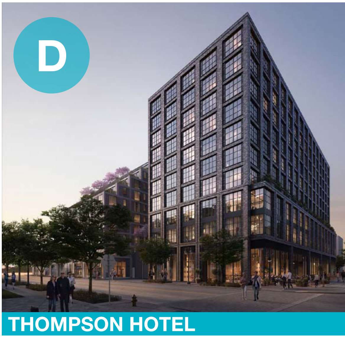
D THOMPSON HOTEL