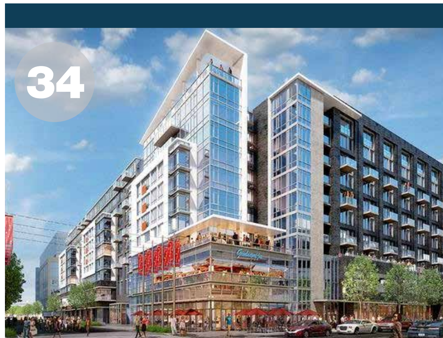
34 1250 JAIR LYNCH REAL ESTATE PARTNERS RESIDENTIAL: 300 APT. / 139 CONDO RETAIL: 55,350 SF