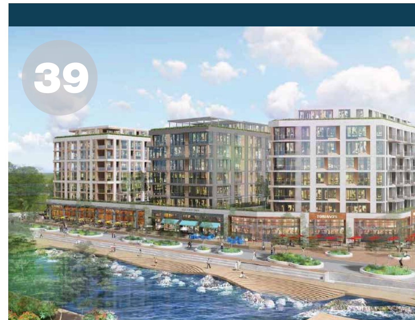
39 RIVER POINT RIVER POINT PARTNERS RESIDENTIAL: 481 APT. UNITS RETAIL: 70,000 SF