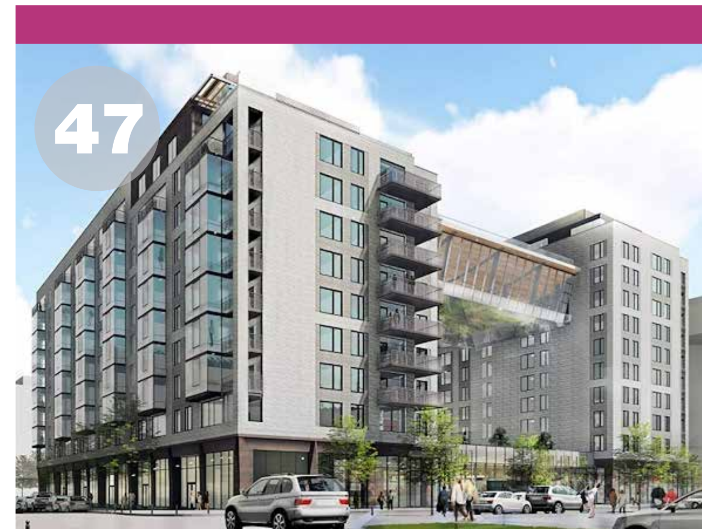
47 THE YARDS PARCEL I FOREST CITY WASHINGTON RESIDENTIAL: 348 APT. UNITS RETAIL: 13,600 SF