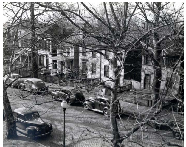
Third Street S.E. – Arthur Capper Site DC Housing Authority

Washington, DC Neighborhood Heritage Trails are developed by neighborhood working groups and the nonprofit Cultural Tourism DC.